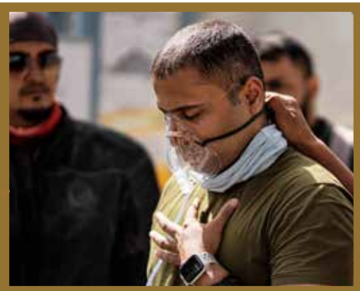
Shot at Tangtse (RNR Season 2021)

We take preventive measures for AMS ie. Acute Mountain Sickness. We keep oxygen cylinders & first aid kit with us in order to minimize any health issues arising at higher altitudes. (3500-5500 mtrs)