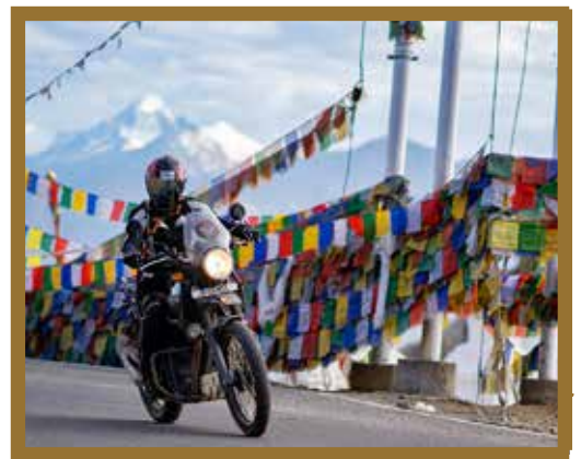
Shot at Shanti Stupa (RNR Season 2021)

Day Highlights: Hall Of Fame, Magnetic Hill, Indus Zanskar Confluence, Lamayuru Monestary, Night stay in Lamayuru/Khaltse