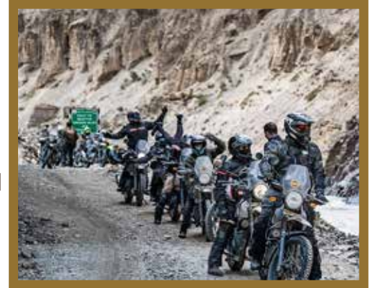
Shot at Zanskar (RNR Season 2021)

The routes via Alchi & Basgo are a perfect example to prove this point. It will give you that extra adrenaline rush that you have been dreaming for a while. Be prepared for a ride of your life-time.