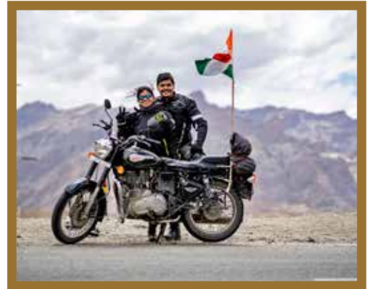
Shot at Sham Valley (RNR Season 2021)

Day Highlights: Ride Briefing, Hemis Monestary, Leh Palace , Thiksey Monestary, Shanti Stupa Leh Market