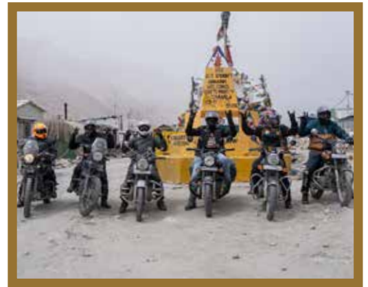
Shot at Chang La (RNR Season 2021)

Pangong Lake Morning View Chang La(Pass), Night stay in Leh