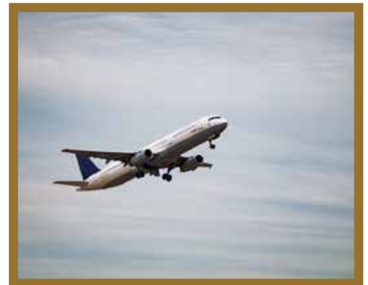
Shot at Delhi (RNR Season 2021)

Fly back home with a life-time memories.