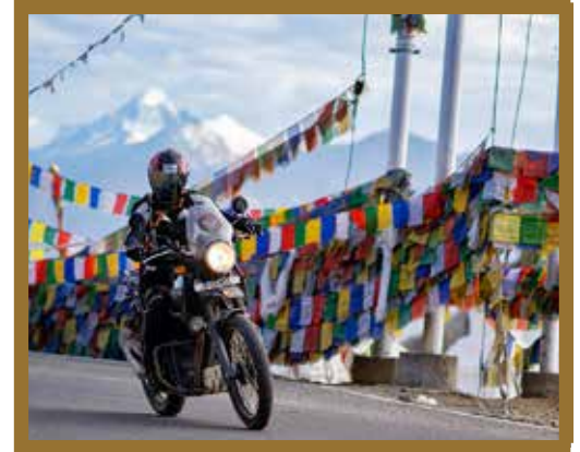
Shot at Shanti Stupa (RNR Season 2021)

Alchi Monestary, Basgo Monestary, Ladakhi Traditional Lunch, Leh Market