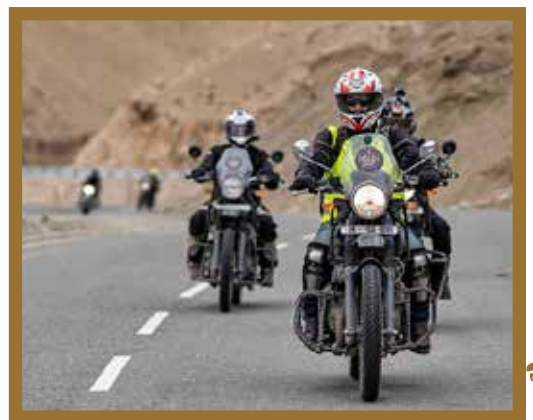
Shot near Khardung La (RNR Season 2021)

The mighty Khardung La (Pass), Diskit Monastery, Buddha Statue, Hunder Sand Dunes