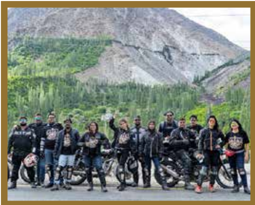
Shot at Kargil (RNR Season 2021)