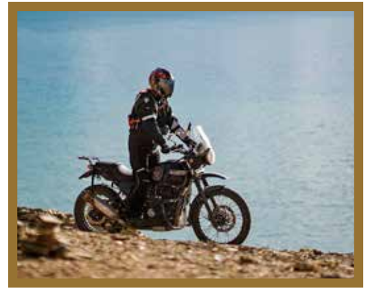
Shot at Pangong Tso (RNR Season 2021)

Agam-Shyok Route, Marmot Point, Lake visit, Night stay in Pangong Lake