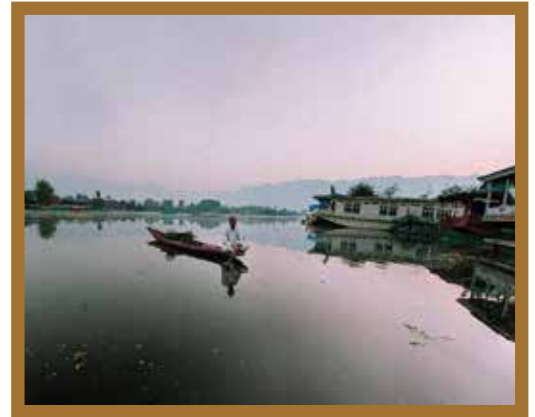
Shot at Dal Lake enroute (RNR Season 2017)