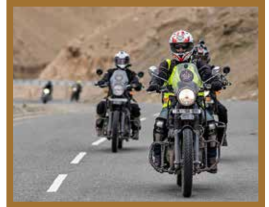
Shot near Khardung La (RNR Season 2021)