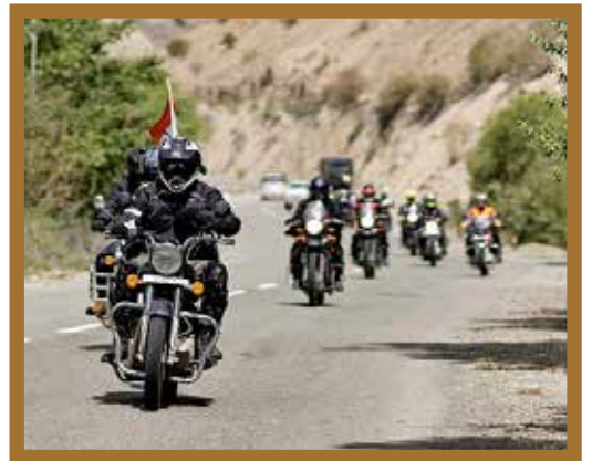
Shot near Dras (RNR Season 2021)