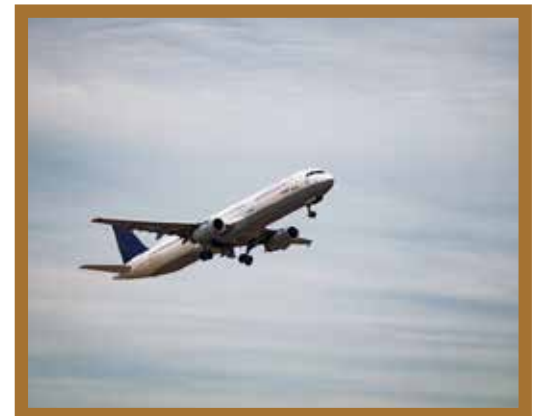
Shot at Delhi (RNR Season 2018)

Afternoon flights are recommended to avoid last minute hassles due to traffic jams or landslides Manali enroute. The Ladakh Experience ends here with a life-time of memories. Cheers to good times!