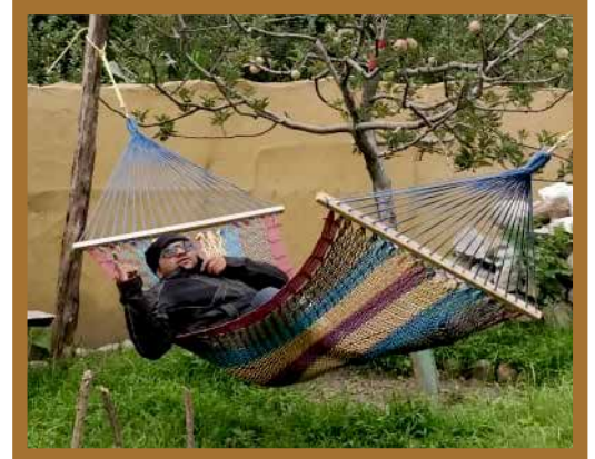
Shot at Manali (RNR Season 2021)

Check-out by 10 am. Chill in Manali during the day. Evening deluxe bus to Chandigarh or Delhi.