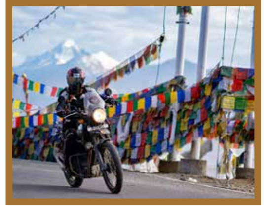
Shot at Tso Moriri to Leh (RNR Season 2021)