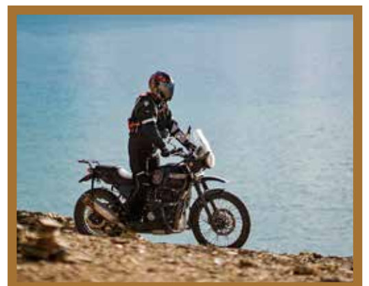
Shot at Tso Moriri (RNR Season 2021)