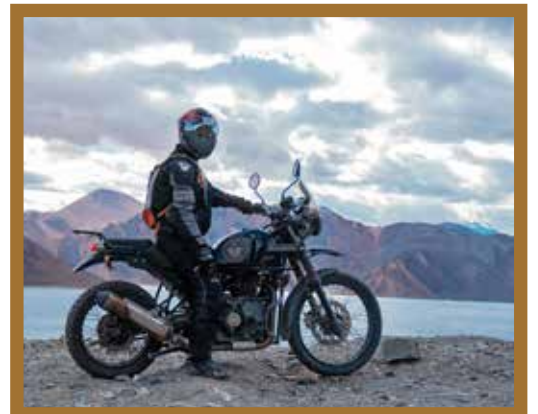
Shot at Pangong Tso (RNR Season 2021)

Agam-Shyok Route, Marmot Point, 3 Idiots Point, Night Stay: Pangong Lake