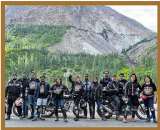
Shot at Kargil (RNR Season 2021)