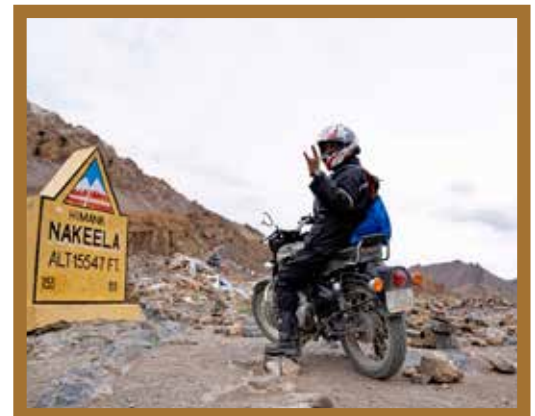
Shot at Nakeela (RNR Season 2021)