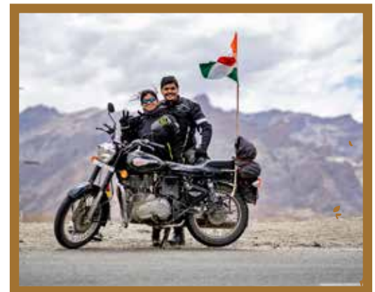
Shot at Sham Valley (RNR Season 2021)