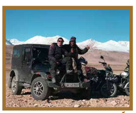
Shot at Hanle (RNR Season 2017)

Our whole team comprises of members from the mountains. The mighty himalaya is our motherland. So, be ready for a very unique riding experience as compared to any other tour agency in the market.