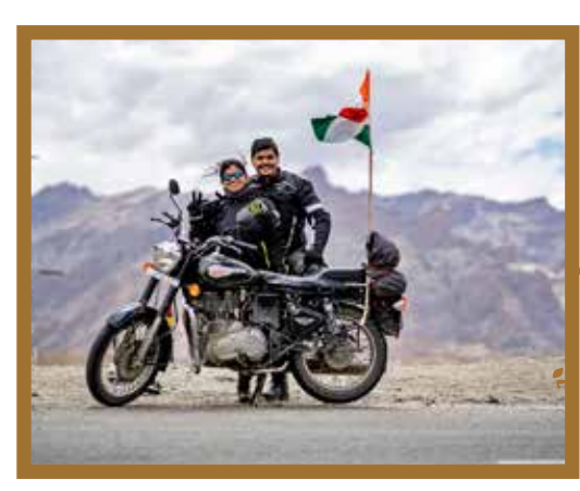
Shot at Sham Valley (RNR Season 2021)

info@rocknrollriders.com +91 9560690969 |+91 7982230093 |+91 135 3159824 Villa 182, Block C, Panache Valley, Dehradun, 248001