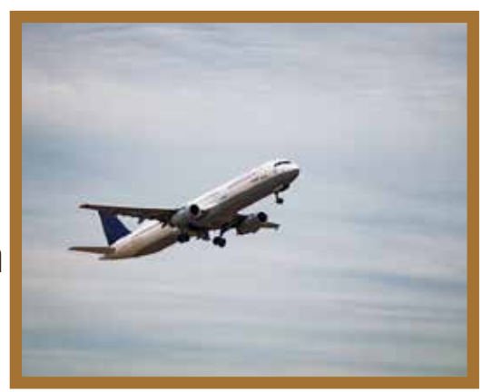
Shot at Delhi (RNR Season 2018)