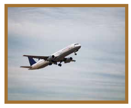
Shot at Delhi (RNR Season 2021)