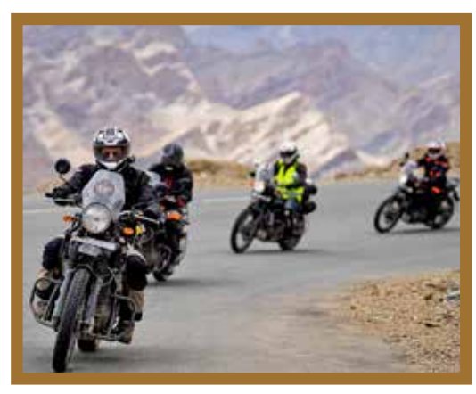
Shot at NH1 (RNR Season 2021)

AND STEADY We believe in EASY riding. We don't ride to race or rally, but to enjoy the beauty of the valley. SAFETY is our major concern. We urge riders to ride with proper safety gears, gloves & full face helmets only.