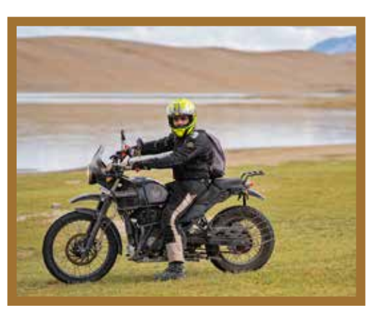
Shot at Kyagar Tso (RNR Season 2021)

What we serve on a platter are very unique, untouched routes of unexplored Ladakh. The inclusion of Tso Moriri & Kyagar Tso via Kaksang La (Pass) is a classic example to prove this point. This less travelled route will give you that extra adrenaline rush that you have been dreaming for a while.