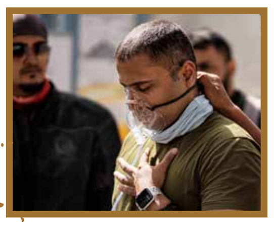
Shot at Tangtse (RNR Season 2021)