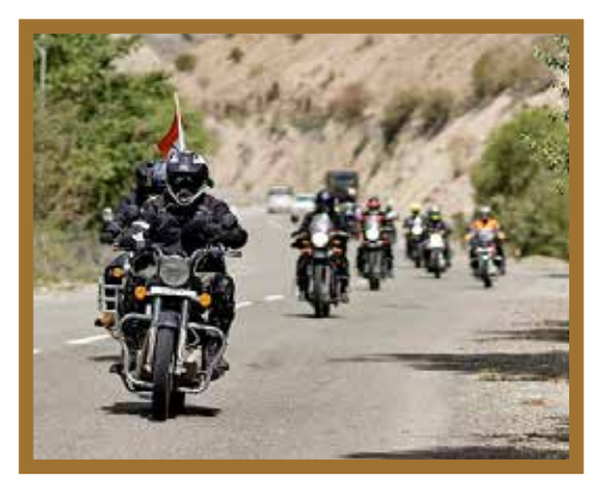
Shot near Dras (RNR Season 2021)