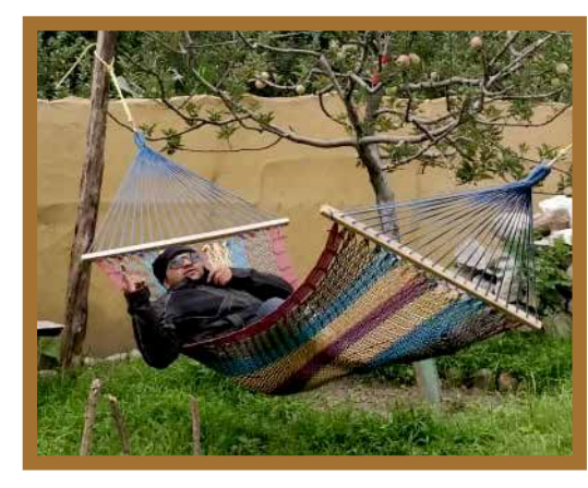
Shot at Manali (RNR Season 2021)