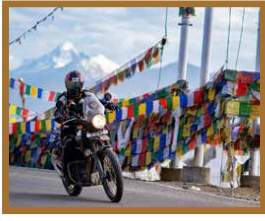
Shot at Tso Moriri to Leh (RNR Season 2021)