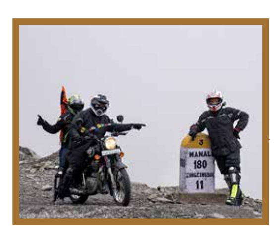
Shot near Zingzing Bar (RNR Season 2021)