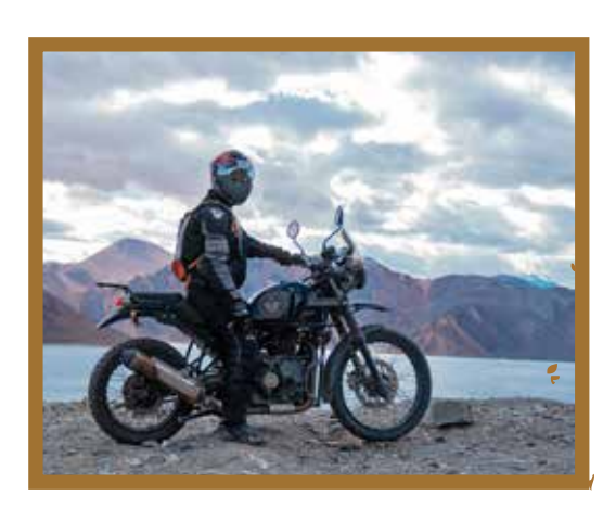
Shot at Pangong Tso (RNR Season 2021)

info@rocknrollriders.com +91 9560690969 | +91 7982230093 | +91 135 3159824 Villa 182, Block C, Panache Valley, Dehradun, 248001