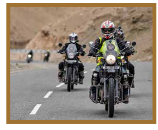
Shot near Khardung La (RNR Season 2021)