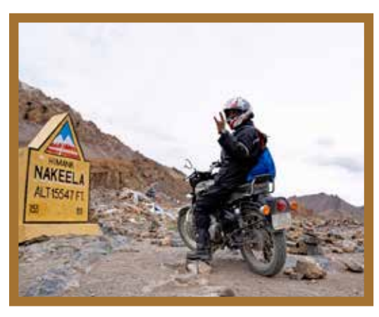
Shot at Nakeela (RNR Season 2021)