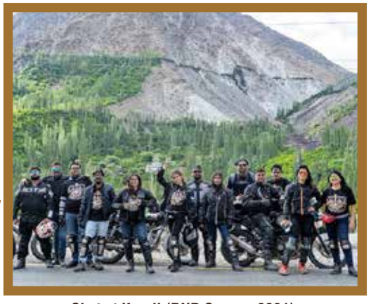
Shot at Kargil (RNR Season 2021)