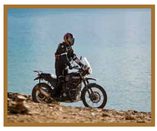
Shot at Tso Moriri (RNR Season 2021)

Nyoma, Tso Moriri, Karzok Night Stay: Tso Moriri Lake