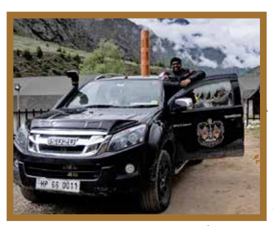
Shot at Jispa (RNR Season 2021)

We always keep a four wheeled support vehicle for on-the-go convenience. It can either be an iSuzu or a Mahindra vehicle. This carries your luggage, oxygen cylinders, extra petrol, mechanical support & spare parts for a worry-free riding experience.