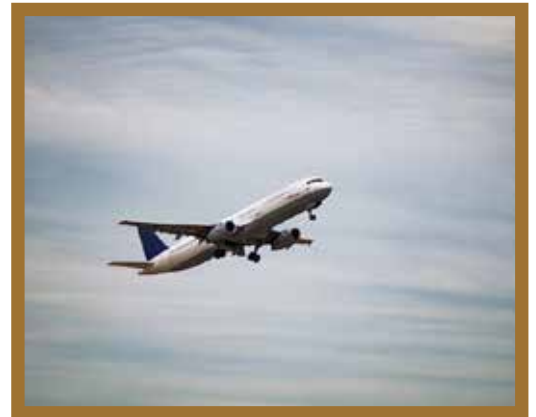
Shot at Delhi (RNR Season 2018)

Day Highlights: The Spiti Experience ends here with a life-time of memories. Cheers to good times!