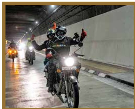
Shot at Atal Tunnel (RNR Season 2021)