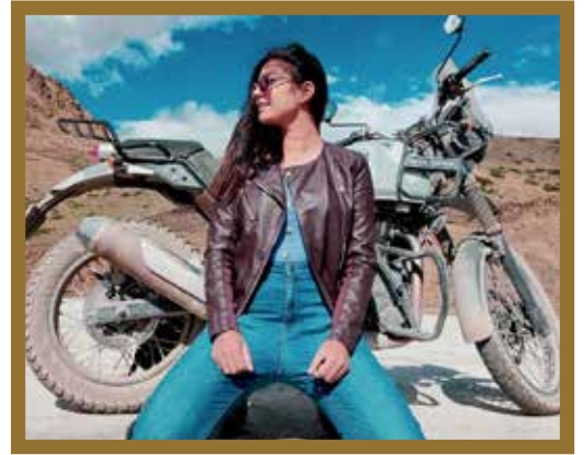
Shot at Nako (RNR Season 2021)