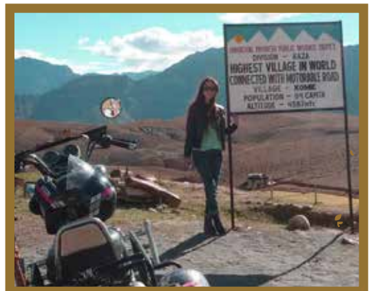
Shot at Komic (RNR Season 2016)