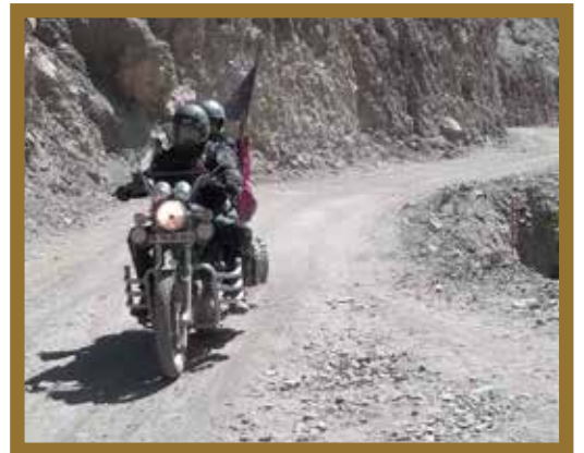
Shot at Sumdo (RNR Season 2017)