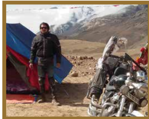
Shot at Chandrataal (RNR Season 2016)