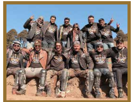
Shot at Jibhi (RNR Season 2018)