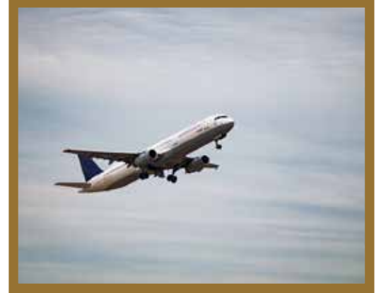
Shot at Delhi (RNR Season 2021)

Day Highlights: Fly to Chd/Delhi by late afternoon. Evening deluxe bus to Manali. Check-in! Meet & greet fellow riders in the morning. No ride day today!