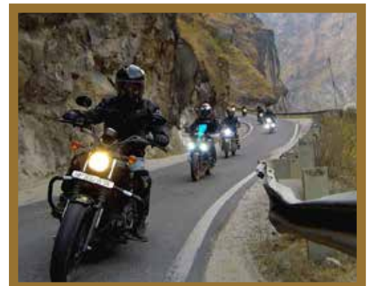
Shot near Rock Tunnel (RNR Season 2019)

Day Highlights: Jalori Pass, Satlaj River, Kinnaur Rock Tunnel, Baspa River, Sangla, Chitkul Night Stay: Chitkul