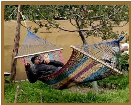
Shot at Manali (RNR Season 2018)

Day Highlights: Check-out by 10 am. Self-explore during the day. Evening bus to Chandigarh/Delhi