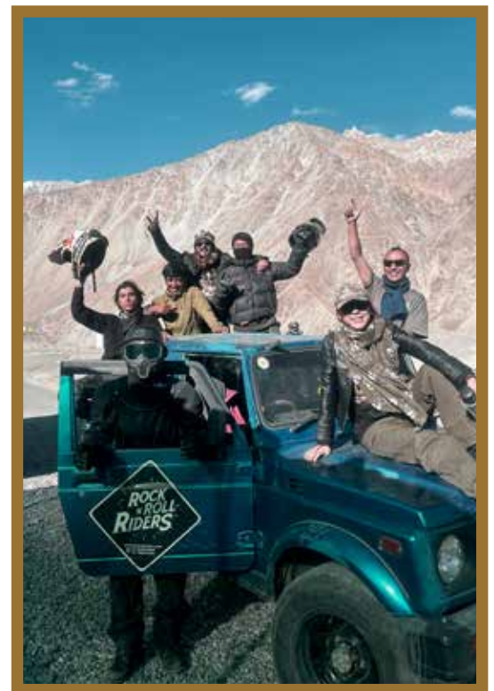
Shot at Padum (RNR Season 2023)