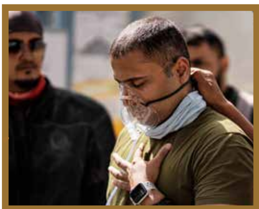
Shot at Tangtse (RNR Season 2021)