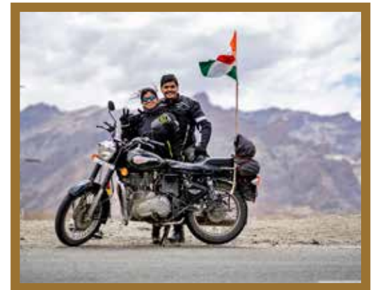
Shot at Sham Valley (RNR Season 2021)