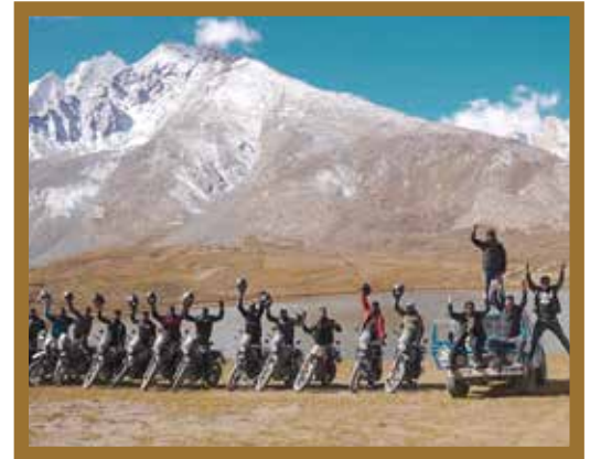
Shot at Langtso Lake (RNR Season 2023)

What we serve on a platter are very unique, untouched routes of unexplored Zanskar. The inclusion of Gonbo Rangjon & Shinkula via Purne is a classic example to prove this point. This less travelled route will give you that extra adrenaline rush that you have been dreaming for a while.