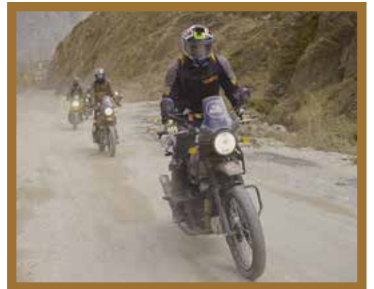
Shot at Lingshed (RNR Season 2023)