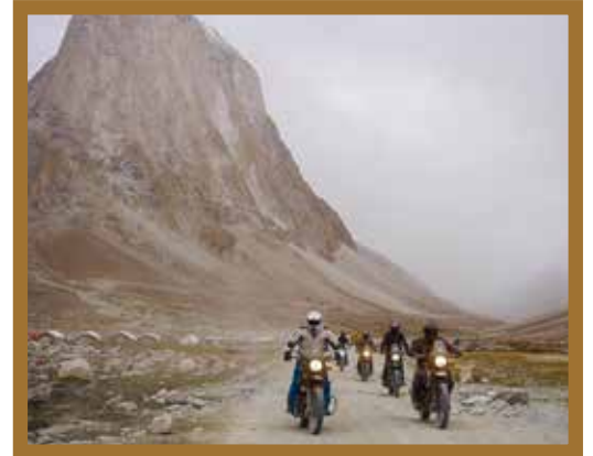
Shot at Gonbo Rangjon (RNR Season 2023)