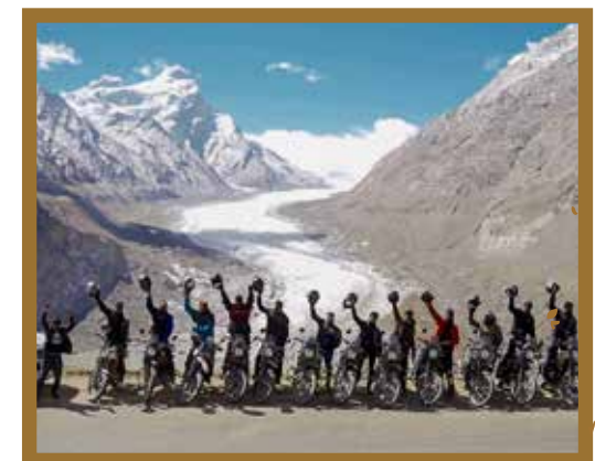
Shot at Drang Drung (RNR Season 2023)