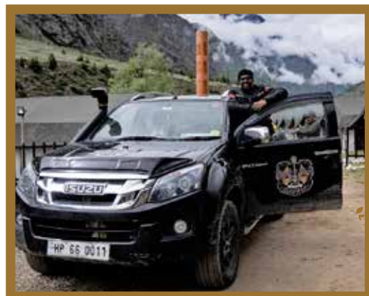
Shot at Jispa (RNR Season 2021)

We always keep a four wheeled support vehicle for on-the-go convenience. It can either be an iSuzu or a Mahindra vehicle. This carries your luggage, oxygen cylinders, extra petrol, mechanical support & spare parts for a worry-free riding experience.