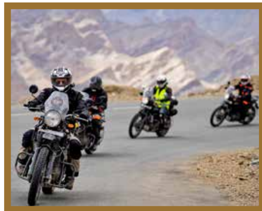
Shot at NH1 (RNR Season 2021)

We believe in EASY riding. We don't ride to race or rally, but to enjoy the beauty of the valley. SAFETY is our major concern. We urge riders to ride with proper safety gears, gloves & full face helmets only.