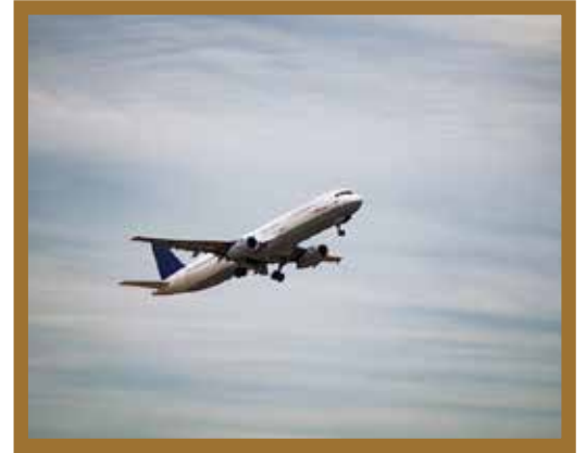
Shot at Delhi (RNR Season 2018)