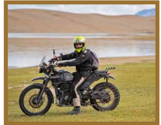
Shot at Kyagar Tso (RNR Season 2021)

The inclusion of Tso Moriri & Kyagar Tso via Pangong is a classic example to prove this point. This less travelled route will give you that extra adrenaline rush that you have been dreaming for a while.