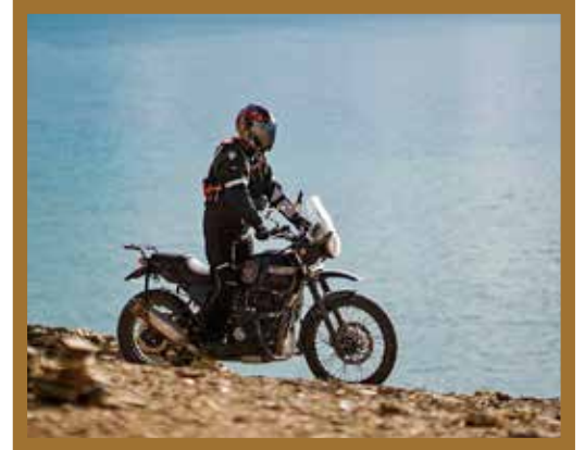
Shot near Hanle (RNR Season 2021)