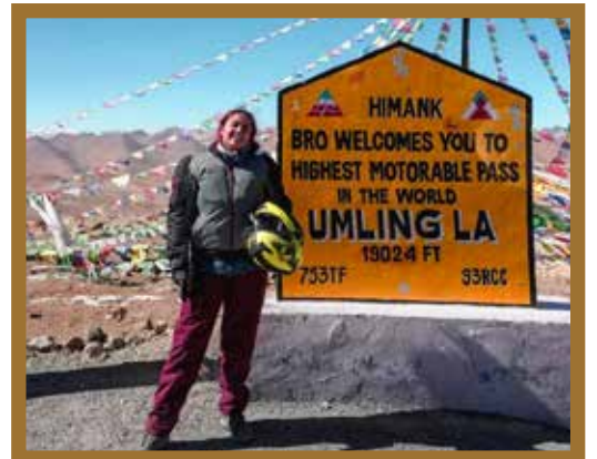
Shot at Umling La (RNR Season 2022)