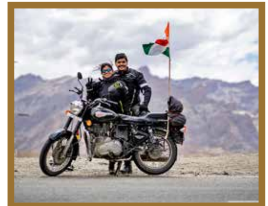
Shot at Sham Valley (RNR Season 2021)