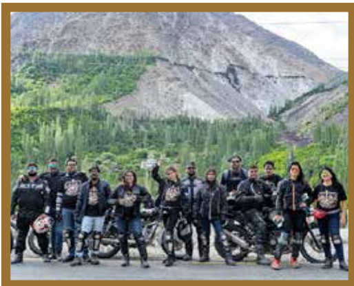
Shot at Kargil (RNR Season 2021)