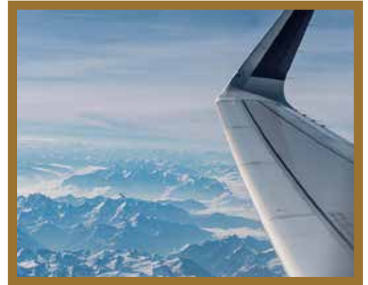
Shot at Ladakh (RNR Season 2021)

Life-time Memories, New Rider Friends. This Day Brings The End Of The Ladakh Experience.