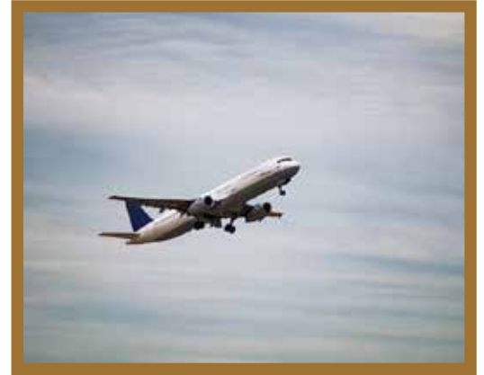
Shot at Delhi (RNR Season 2018)